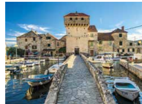
Kaštela Gomilica, Kaštillac – Game of Thrones location