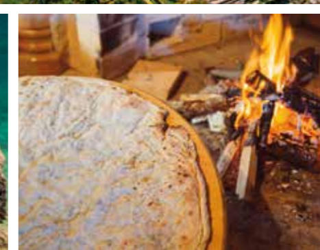
Soparnik, tradicionalno jelo / Soparnik, traditional dish