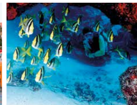
Ronjenje / Diving