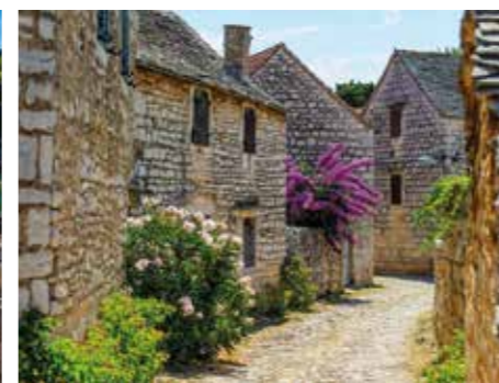
Grohote: Tradicijske građevine / Traditional architecture