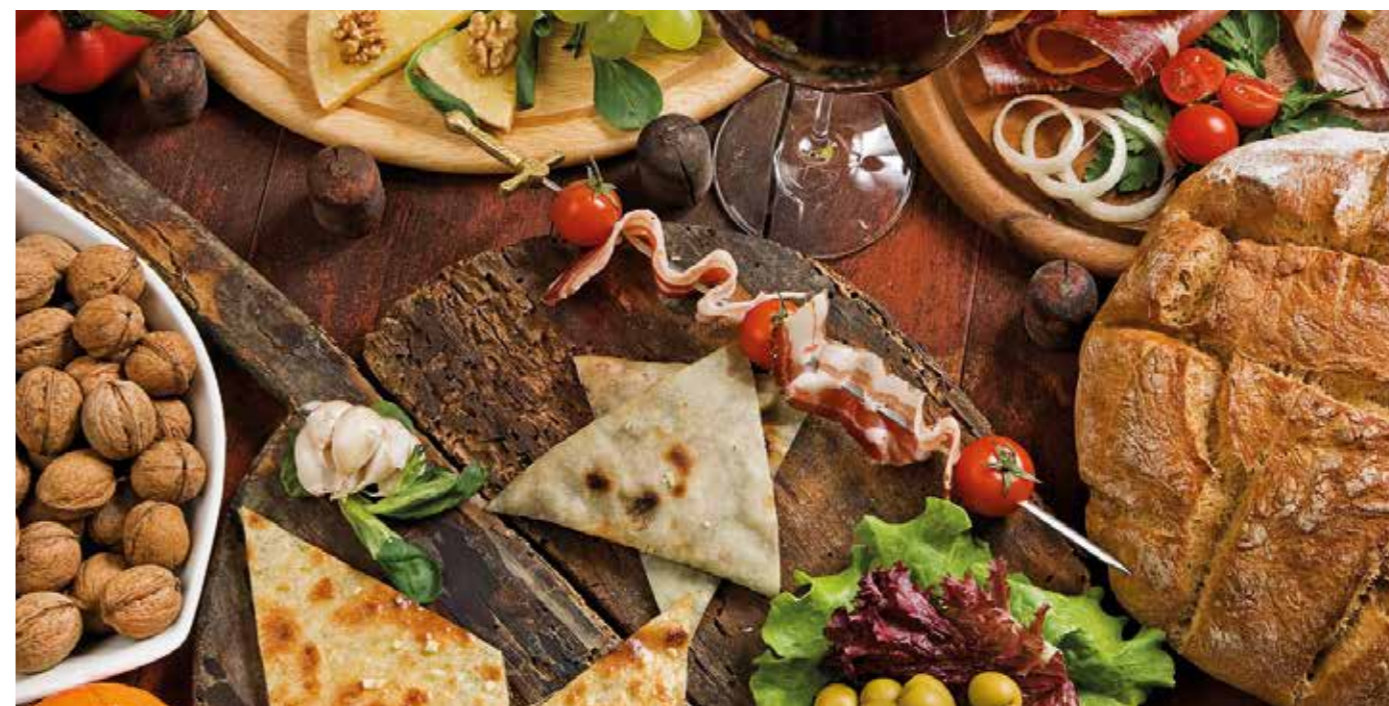
Podstranski jelovnik / At the table...