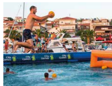
Jadranske igre / City Games