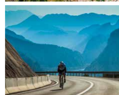
Aktivan odmor / Active vacation