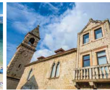
Kaštel Sućurac – Nadbiskupska palača & Muzej grada Kaštela / Archbishops palace & Museum of the Town of Kaštela