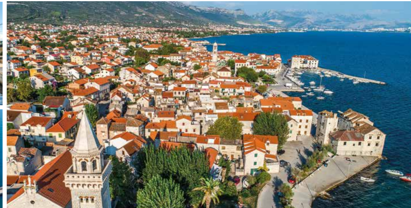
Kaštel Štafilici & Kaštel Novi, Panorama / View