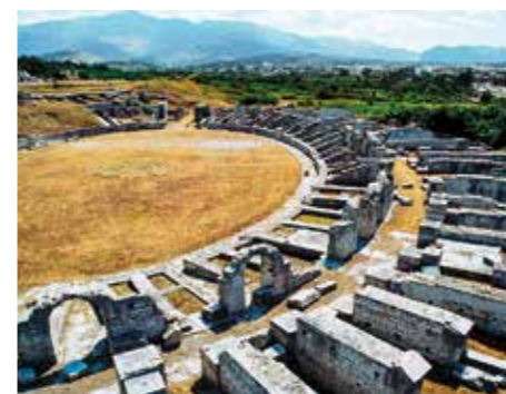
Amfiteatar, Salona / Amphitheatre, Salona