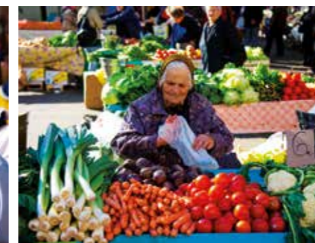
Gastronomija / Gastronomy