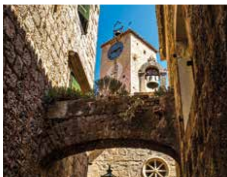
Crkva sv. Roka / St. Roch Church