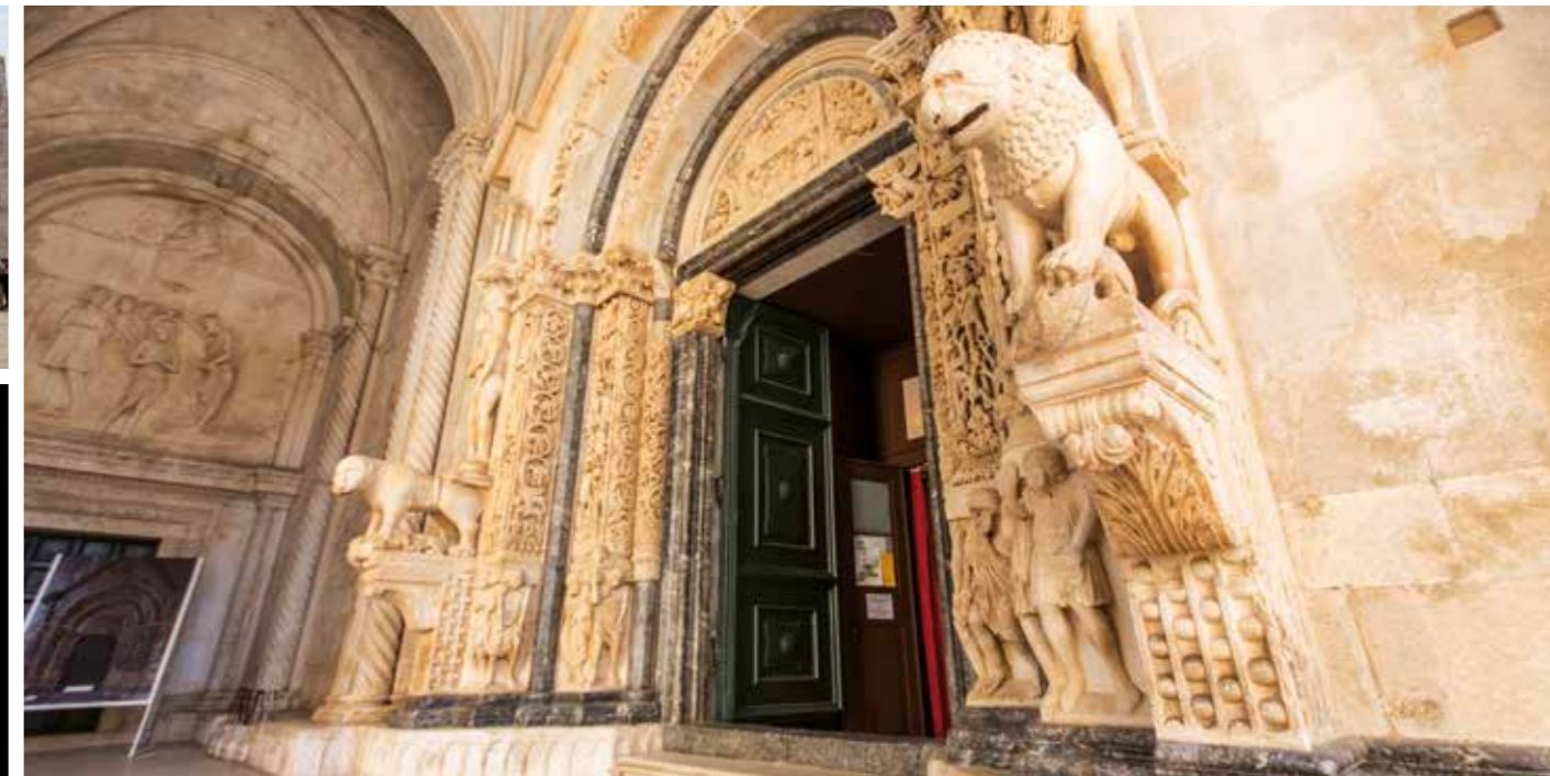
Portal majstora Radovana / Radovan's portal