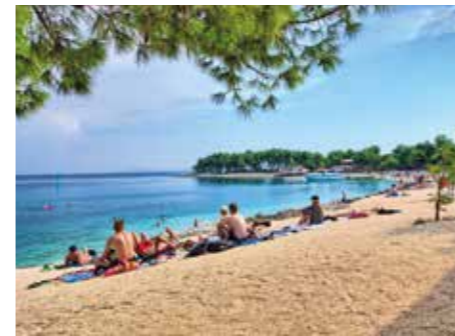
Plaža Labadusa / Labadusa Beach

#visitokrug #tocbeach #camping #diving #gastronomy #bike #cyclotours