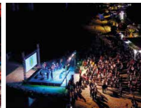
Okruške ljetne večeri / Okrug Summer Nights

📍 Bana Jelačića 15 21223 Okrug Gornji 🏠 www.visitokrug.com ✉ info@visitokrug.com ☎ 00385 21 887 311 📘 visitokrug 📷 visitokrug