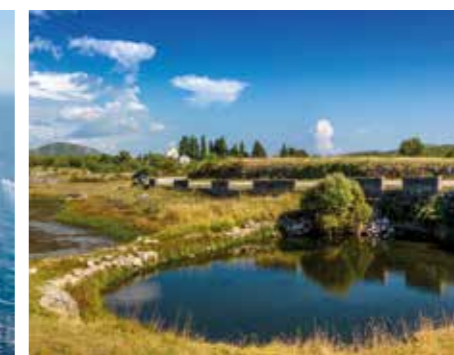
Lokva na Blizni / Puds in Blizna

📍 Ante Rudana 47, 21222 Marina 🏠 www.tz-marina.hr ✉ info@tz-marina.hr ☎ 021 889 015 📘 Marina Tourist Board 📷 visitmarina