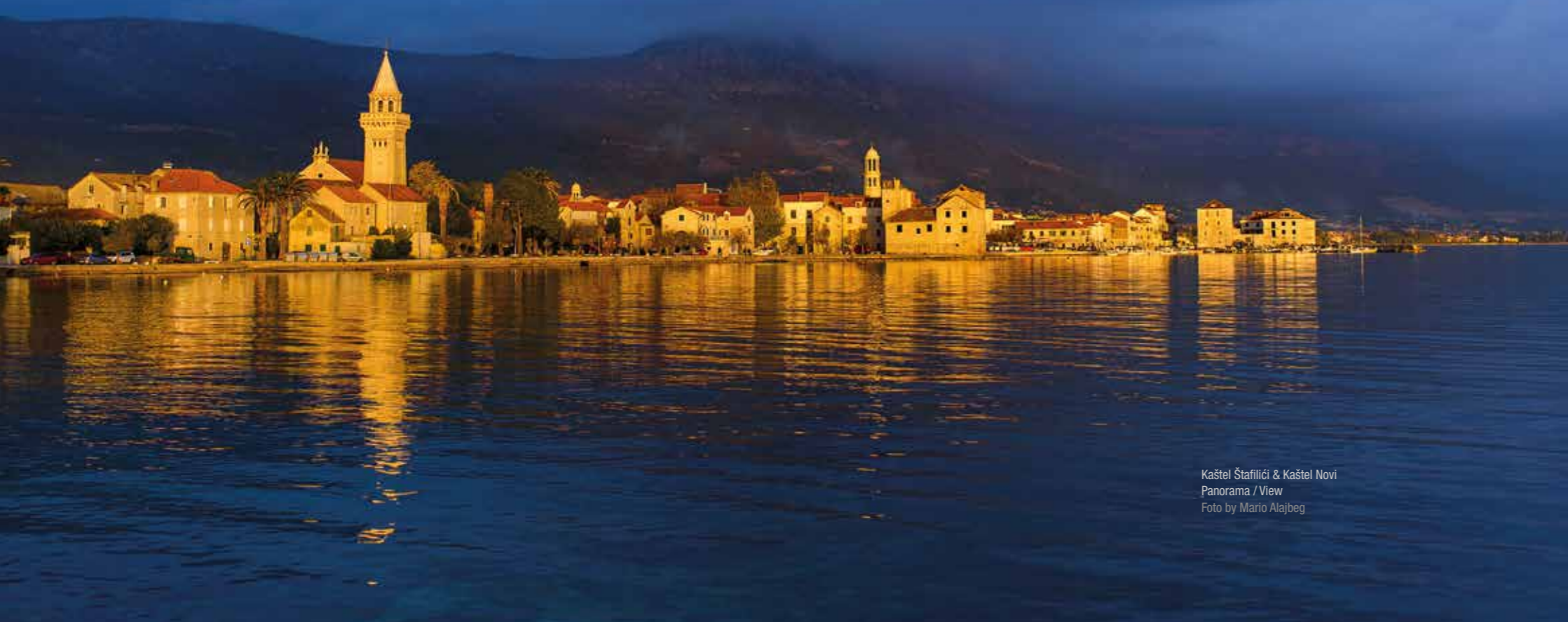
Kaštel Štafilici & Kaštel Novi Panorama / View

#kastela #kaštela #visitkastela #crljenakkaštelanski #zinfandel