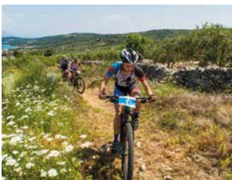
Rekreacija / Recreation

TROGIR turistička zajednica - tourist board