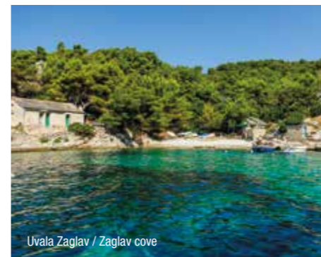
Uvala Zaglav / Zaglav cove