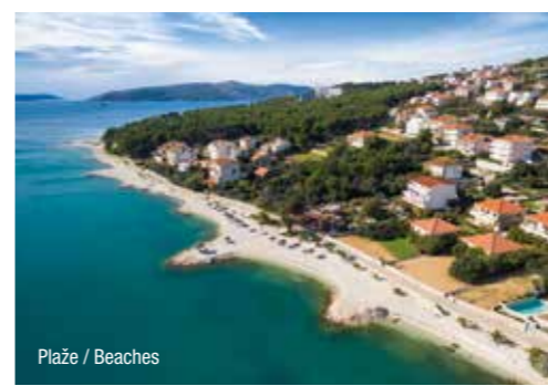
Plaže / Beaches