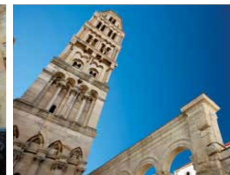
Zvonik Sv. Dujе / St. Domnius Bell Tower