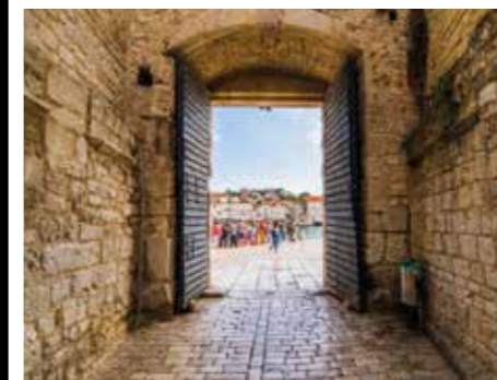
Južna gradska vrata / The southern gate of the town