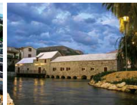
Gašpina mlinica / Gašpina watermill