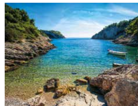
Uvala Jorja / Jorja cove