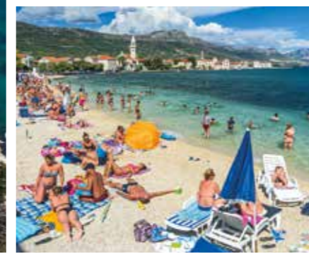
Kaštel Štafilic Plaža Gabine / Gabine Beach