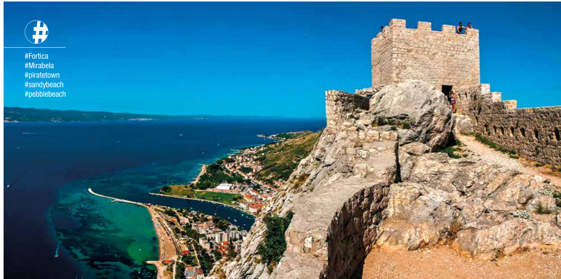
Tvrđava Fortica / Fortica Fortress