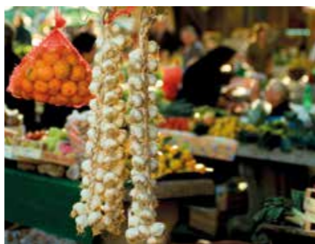
Tržnica / Market