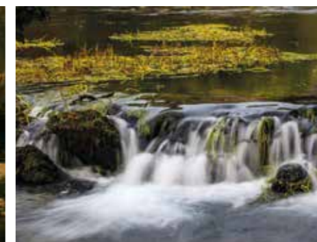
Rijeka Jadro / River Jadro