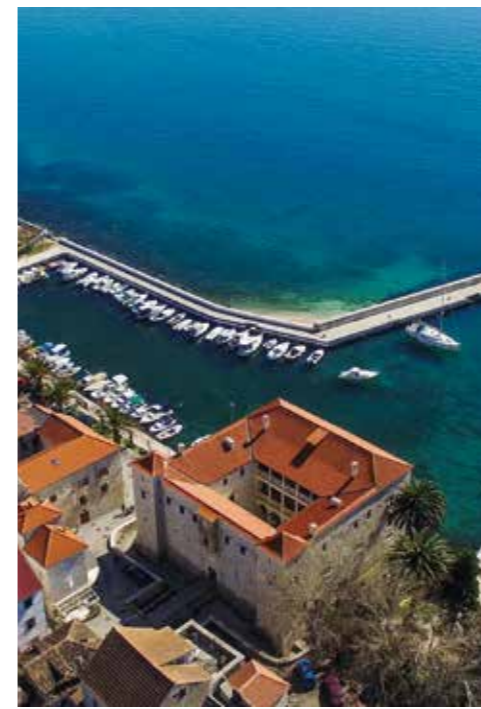
Kaštel Lukšić - Dvorac Vitturi & Muzej grada Kaštela / Vitturi Castle & Museum of the Town of Kaštela