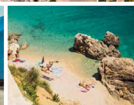
Plaža u Omišu / Beach in Omiš