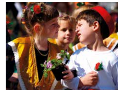
Kultura / Culture