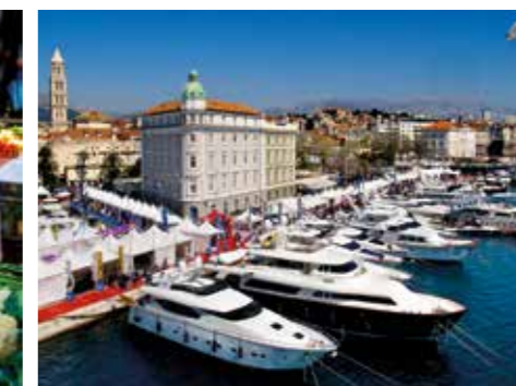
Nautika / Yachting

📍 Obala Hrvatskog narodnog preporoda 9, 21000 Split 🏠 www.visitsplit.com 📧 info@visitsplit.com ☎ 00385 21 348 600 📱 visitsplit 📷 visitsplit