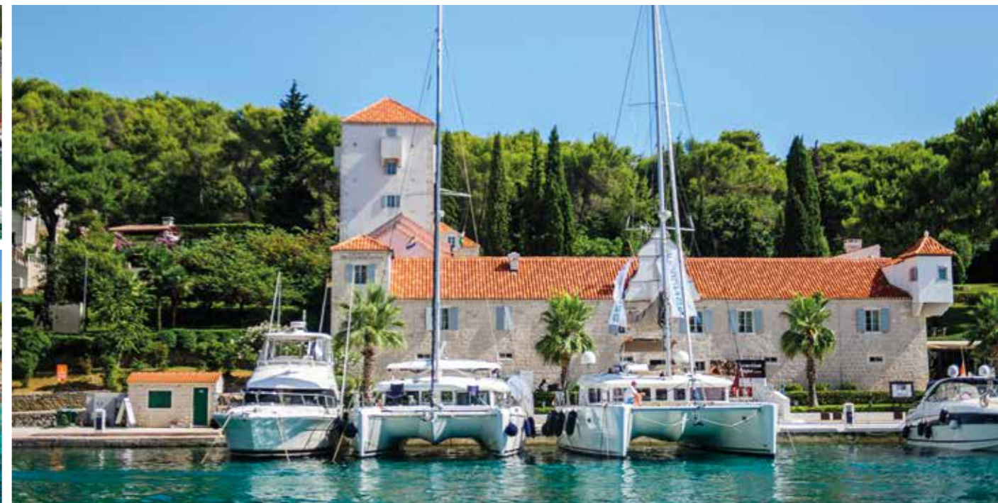
Maslinica: pogled na Martinis Marchi / Martinis Marchi view