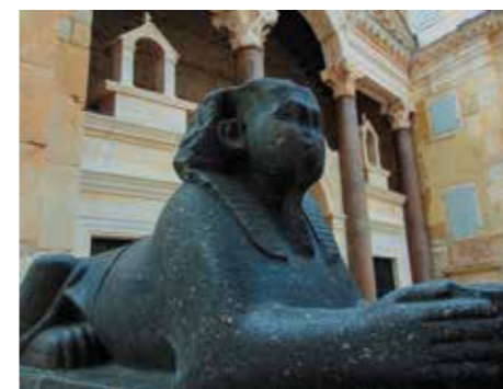
Sfinga / Sphinx