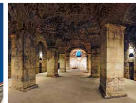
Dioklecijanovi podrumi / Diocletian's Cellars