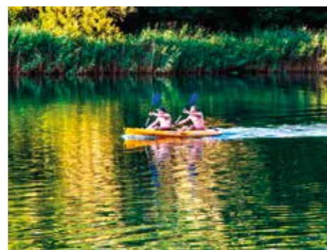
Aktivni odmor / Active vacation